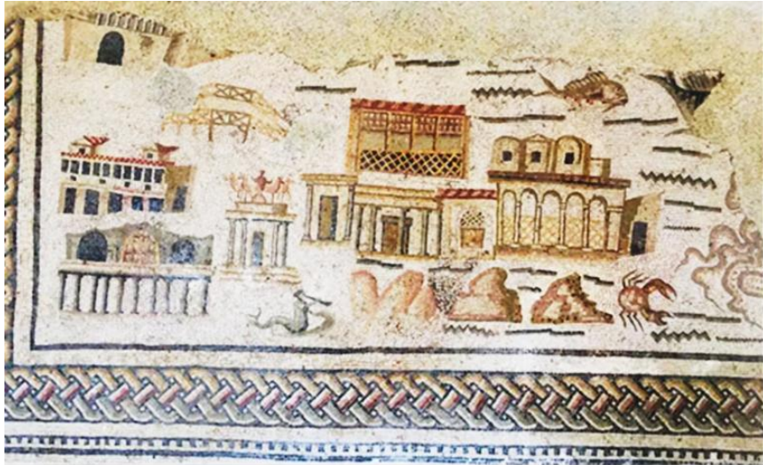
Picture (18): Mosaic depicting a panoramic view of the old city of Annaba, (Annaba Museum).