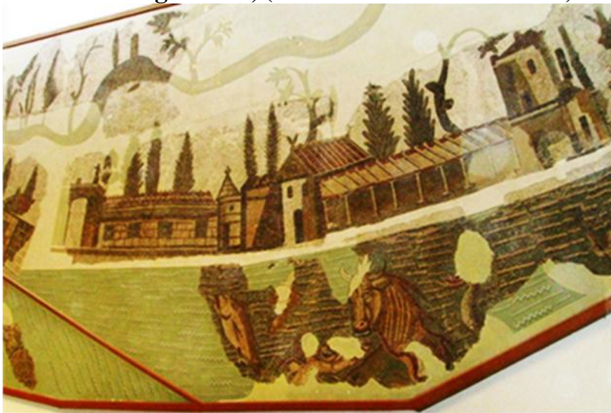
Picture (19): A mosaic representing a seaside villa with a facade overlooking the sea, (Bardo Museum in Tunisia).